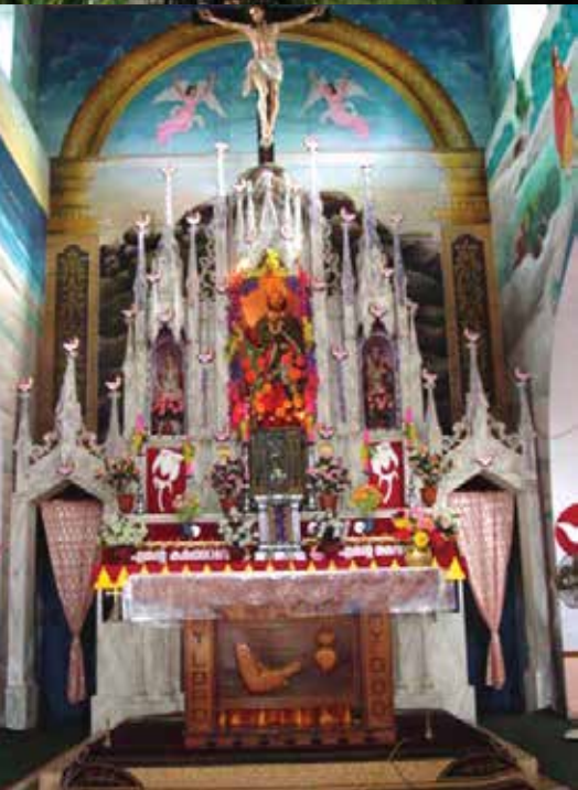
Top: A miniature Vatican at the place where St. Thomas supposedly landed on the Western shore of India. Middle: An ancient Syrian Church near Cochin, India. Bottom: Inside a St. Thomas Christian church. It is a mirrored reflection of Catholicism.

all churches throughout the world celebrate the sacred mysteries (The Lord's Supper) on the Sabbath of every week, yet the Christians of Alexandria and at Rome, on the account of some ancient tradition, refuse to do this. The Egyptians in the neighborhood of Alexandria, and the inhabitants of Thebais hold their religious meetings on the Sabbath." 12