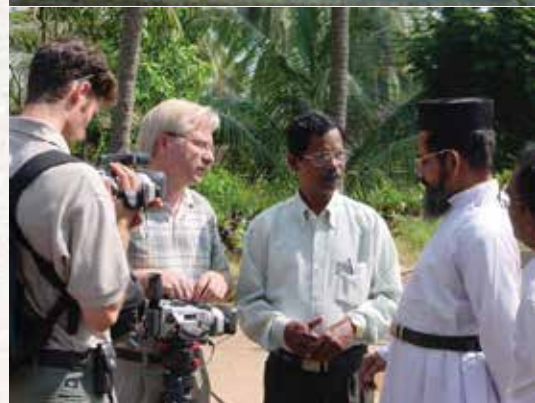
Top: The Catholic-looking shrine at the Coonan Cross.