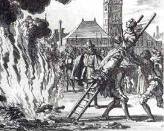
Upper: Nazi Germany burning books viewed as being subversive or as representing ideologies opposed to Nazism.