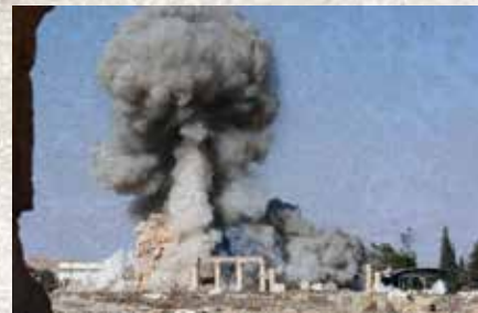
ISIS destroys a well-preserved archaeological site in Palmyra, Syria.

Kaliph Omar or the second Khalifa of Islam. And of course, Islamic revisionists try to say that they're not responsible for the destruction of this library. In these attempts, Islam is simply trying to cleanse the world of any history, theology, or ideology that goes against who they are and what they believe. This is the heart of what revisionists do.